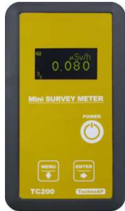
Dose rate mode