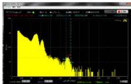
Dedicated Application (Spectrum mode)