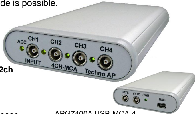
APG7400A USB-MCA 4 (Upper : Front, Under : Rear)